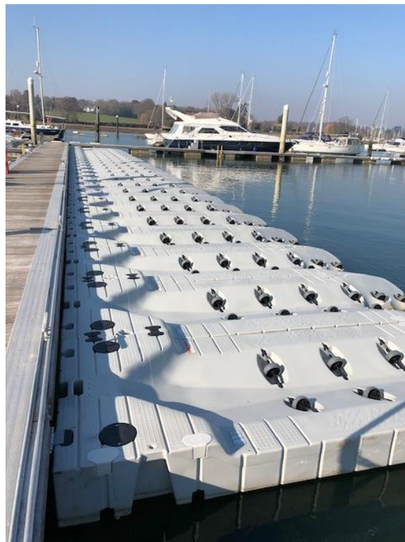
Proposed Jet Ski Pods